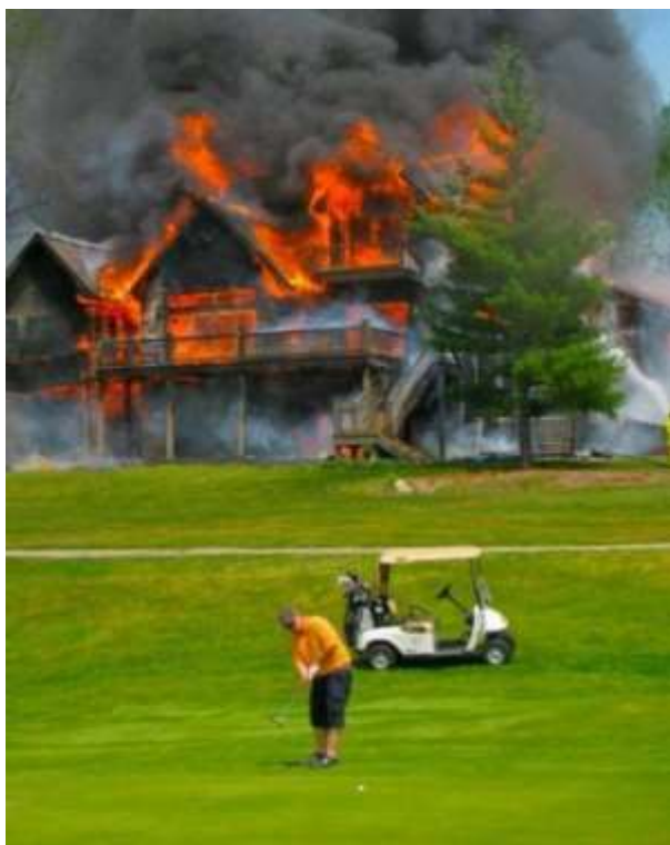
Figure 1: Concentrate!